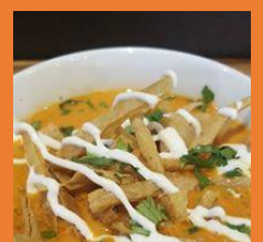
Chicken Tortilla Soup