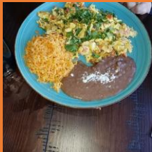
Huevos a la Mexicana