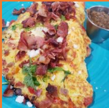
Bacon Veggie Omelette