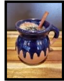
Café de Olla, spiced sweet Cinnamon Coffee