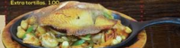
Fajitas del Mar

Grilled shrimp and scallop topped with a crusty tilapia. For one 16.00 For two 30.50