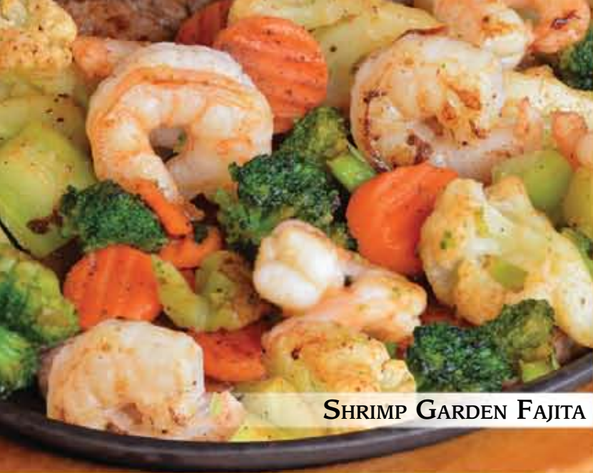
SHRIMP GARDEN FAJITA