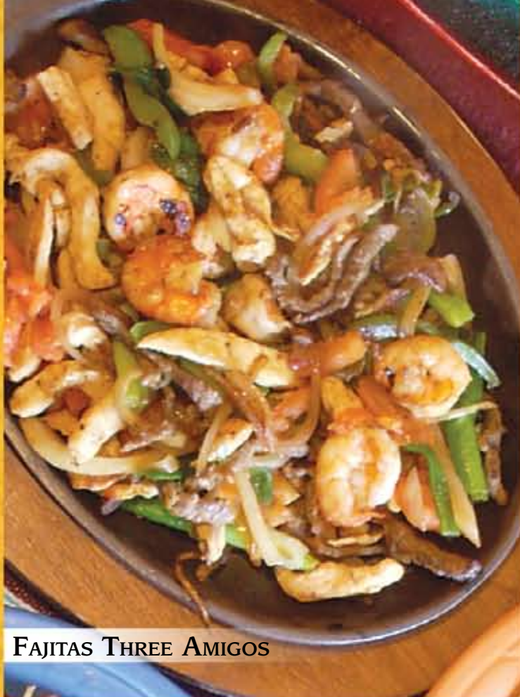
FAJITAS THREE AMIGOS

The whole works! With chorizo, shrimp, chicken and steak FOR ONE - 14.99 TWO - 25.99