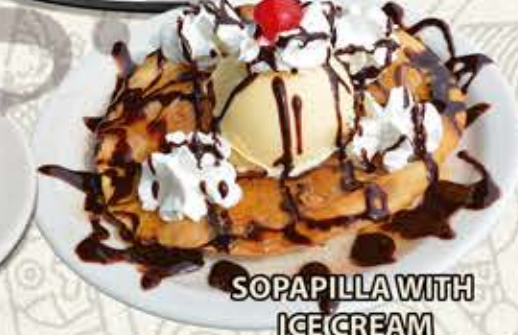
SOPAPILLA WITH ICE CREAM