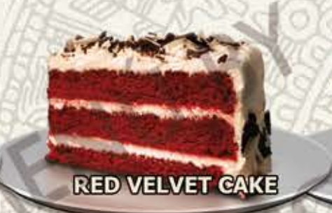
RED VELVET CAKE