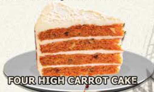
FOUR HIGH CARROT CAKE