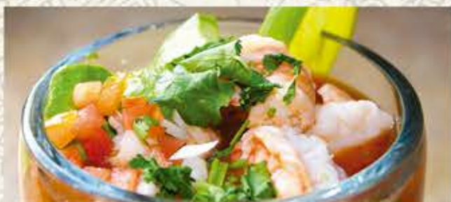
Cocktail de Camarones

Flour tortillas grilled and filled with cheese, grilled onion, peppers, tomatoes and shrimp. Served with guacamole salad, sour cream and rice. 10.50