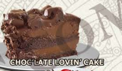
CHOC' LATE LOVIN' CAKE