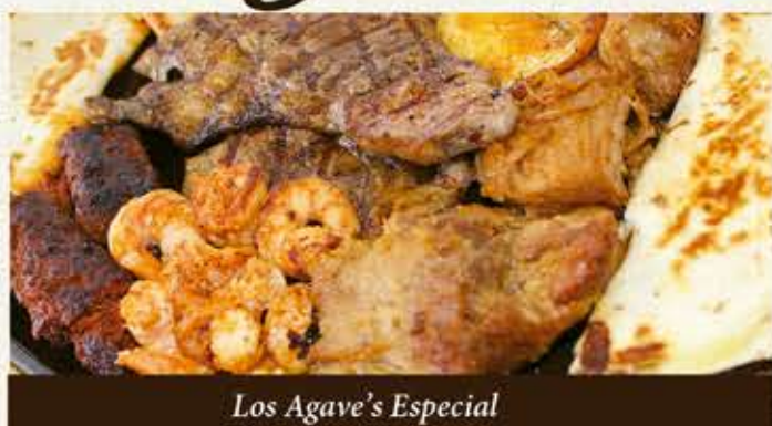
Los Agave's Especial