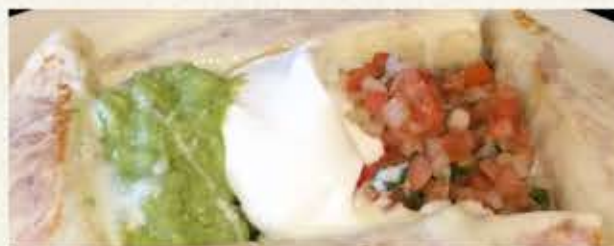
Quesadillas Supremas 9.99

Four rolled corn tortillas, one beef, one chicken, one cheese, and one bean. Topped with enchilada sauce, lettuce, tomatoes, and sour cream. 8.50