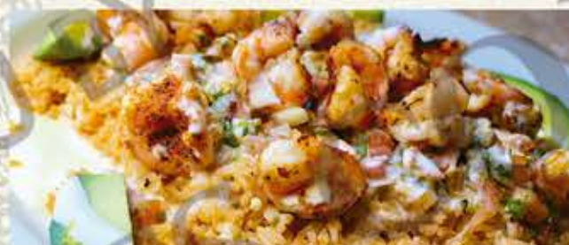
Camarones a la Mexicana

* CAUTION: PLATES COME OUT HOT! CONSUMING RAW OR UNDERCOOKED MEATS, POULTRY, SEAFOOD, SHELLFISH OR EGGS MAY INCREASE YOUR RISK OF FOODBORNE ILLNESS, ESPECIALLY IF YOU HAVE A MEDICAL CONDITION. PLEASE INFORM YOUR SERVER OF ANY FOOD ALLERGIES.