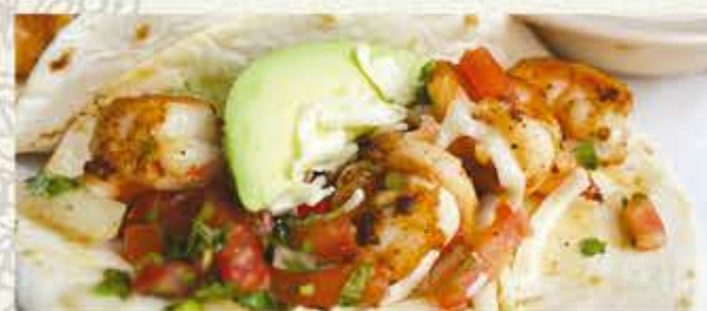
Special Fish or Shrimp Tacos