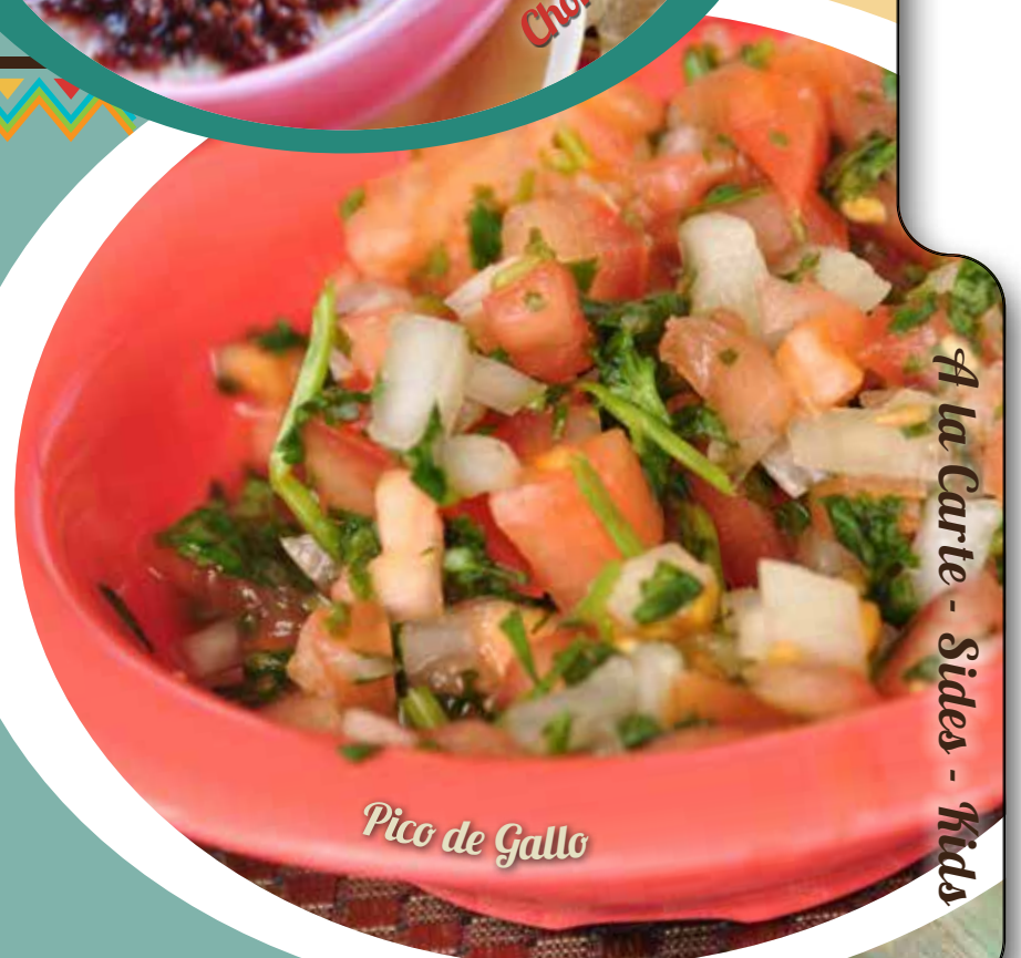
Pico de Gallo