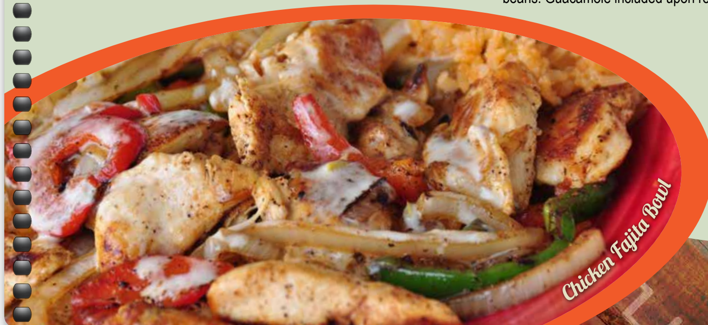
Chicken Fajita Bowl