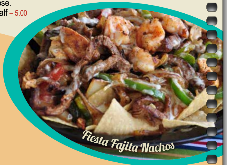
Fiesta Fajita Nachos

Dressings: Blue Cheese, Thousand Island, Italian or Ranch – 2.75