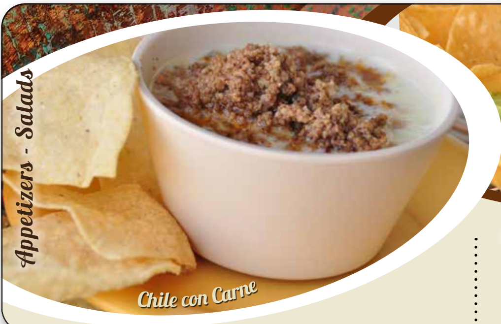
Chile con Carne