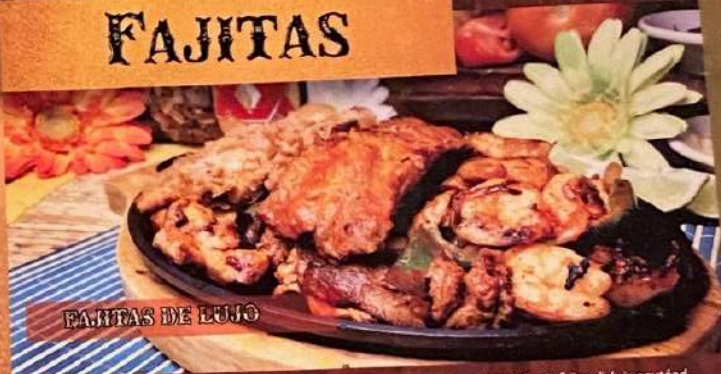
FAJITAS DE LUJO

We bring each fajita to your table in a sizzling cast iron skillet. Each fajita dish is sautéed with our homemade red sauce, onions and bell peppers. Served with pico de gallo, sour cream, salad, rice, beans and three flour tortillas.