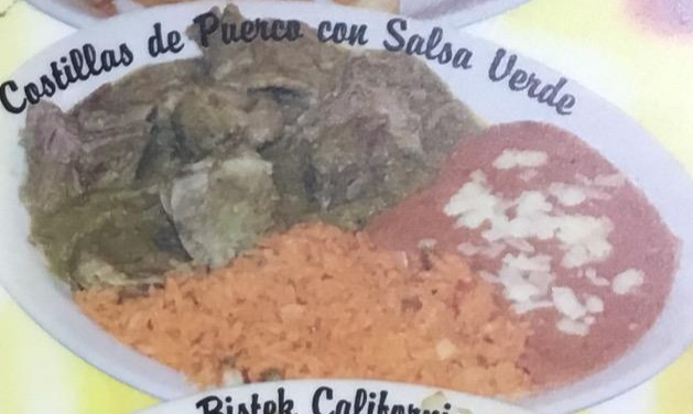
Costillas de Puerco con Salsa Verde