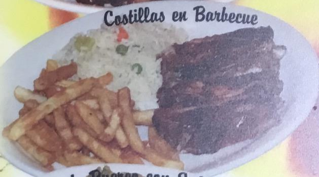
Costillas en Barbecue