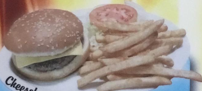
Cheeseburger & fries