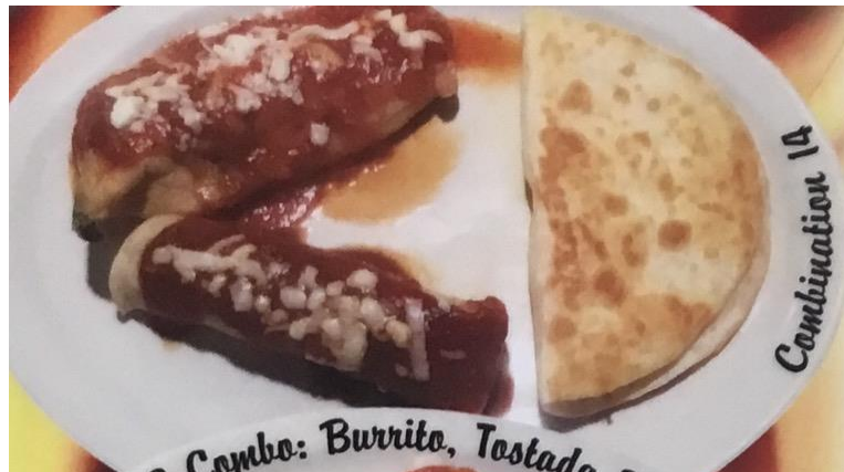
Pick 3 Combo: Burrito, Tostada & Tamale