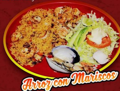
Arroz con Mariscos

Fresh shrimp marinated in lime juice and served with a spicy habanero sauce and fresh mango.