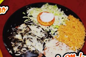
Enchiladas de Mole