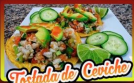
Tostada de Ceviche

MEAT CHOICES: Carne asada (steak), Carnitas (pork), Pastor (marinated pork), Pollo (chicken), Chorizo (Mexican sausage)