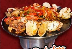
Specialties to share