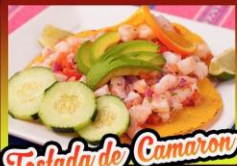
Tostada de Camaron