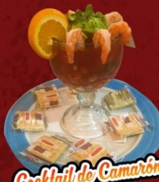
Cocktail de Camaron