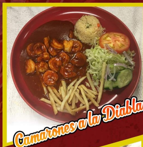
Camarones a la Diabla