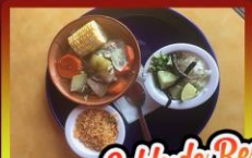
Caldo de Res