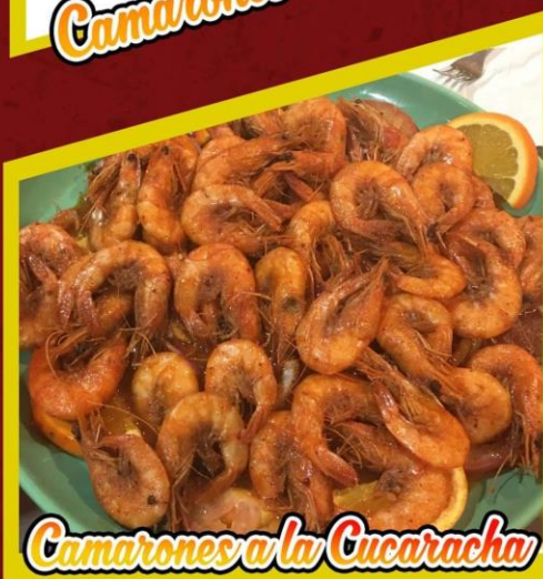
Camarones a la Cucaracha