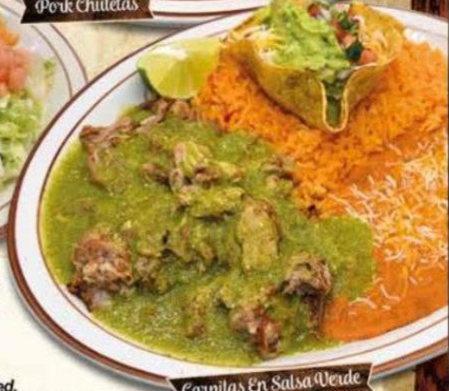
Carnitas En Salsa Verde