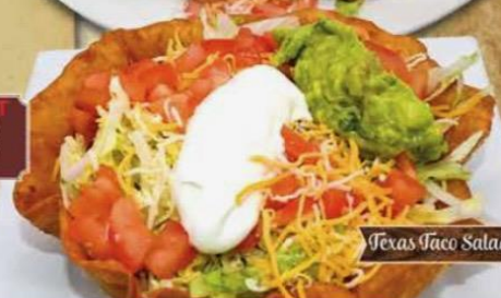
Texas Taco Salad

! WARNING ! PLATES ARE EXTREMELY HOT Limit two baskets of complimentary chips and salsa with a minimum $10 purchase. • Extra baskets of chips $2.00 each