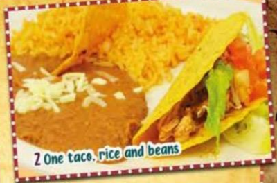
2 One taco, rice and beans