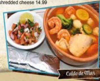
Caldo de Mar

*CONSUMER ADVISORY Thoroughly cooking food of animal origin such as beef, eggs, fish, lamb, pork, poultry, or shellfish reduces the risk of foodborne illness. Individuals with certain health conditions may be at higher risk if these foods are consumed raw or undercooked. Hamburger and eggs might not be cooked. Consult your physician or public health official for further information. [ Iowa Code section 157C.21(9) ]