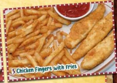
5 Chicken Fingers with fries