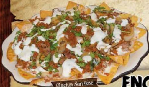
Nachos San Jose