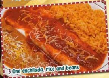
3 One enchilada, rice and beans