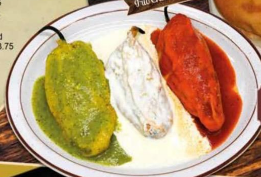
Frio Chile Relleno