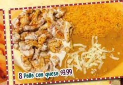
8 Pollo con queso $9.99