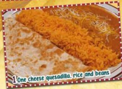
1 One cheese quesadilla, rice and beans