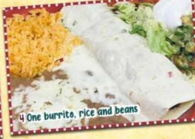
4 One burrito, rice and beans