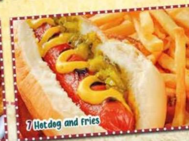
7 Hotdog and fries