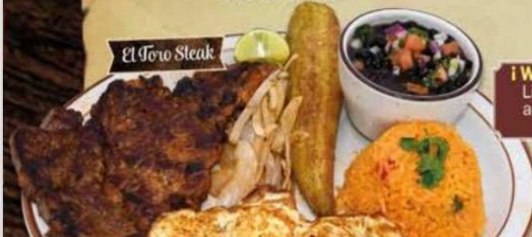
El Toro Steak

! WARNING ! Plates are extremely HOT Limit two baskets of complimentary chips and salsa with a minimum $10 purchase. • Extra baskets of chips $2.00 each