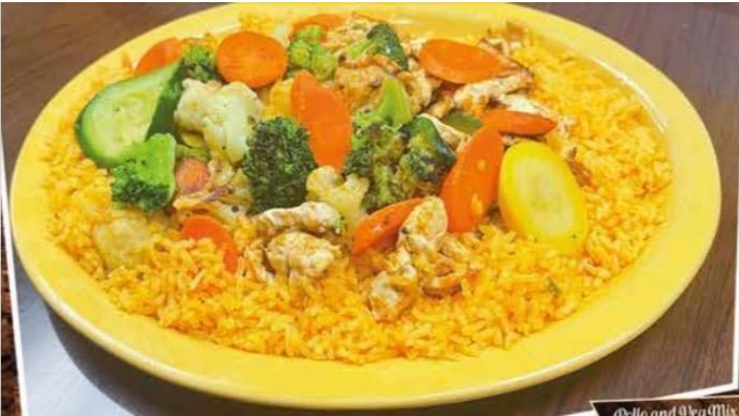
Pollo and Veg Mix