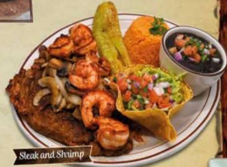
Steak and Shrimp

Ribeye steak grilled to perfection and topped with grilled shrimp, grilled peppers and onions. Served with rice, beans, day salad and warm flour tortillas. 24.99