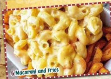
6 Macaroni and fries